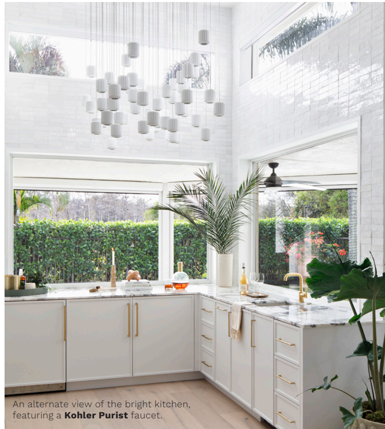
An alternate view of the bright kitchen, featuring a Kohler Purist faucet.

Weisz calls the primary bath a true Cinderella story. “The space was dark, dated, and lacked flow,” she says. “Our goal was to create a spa-like retreat that maximized the lush