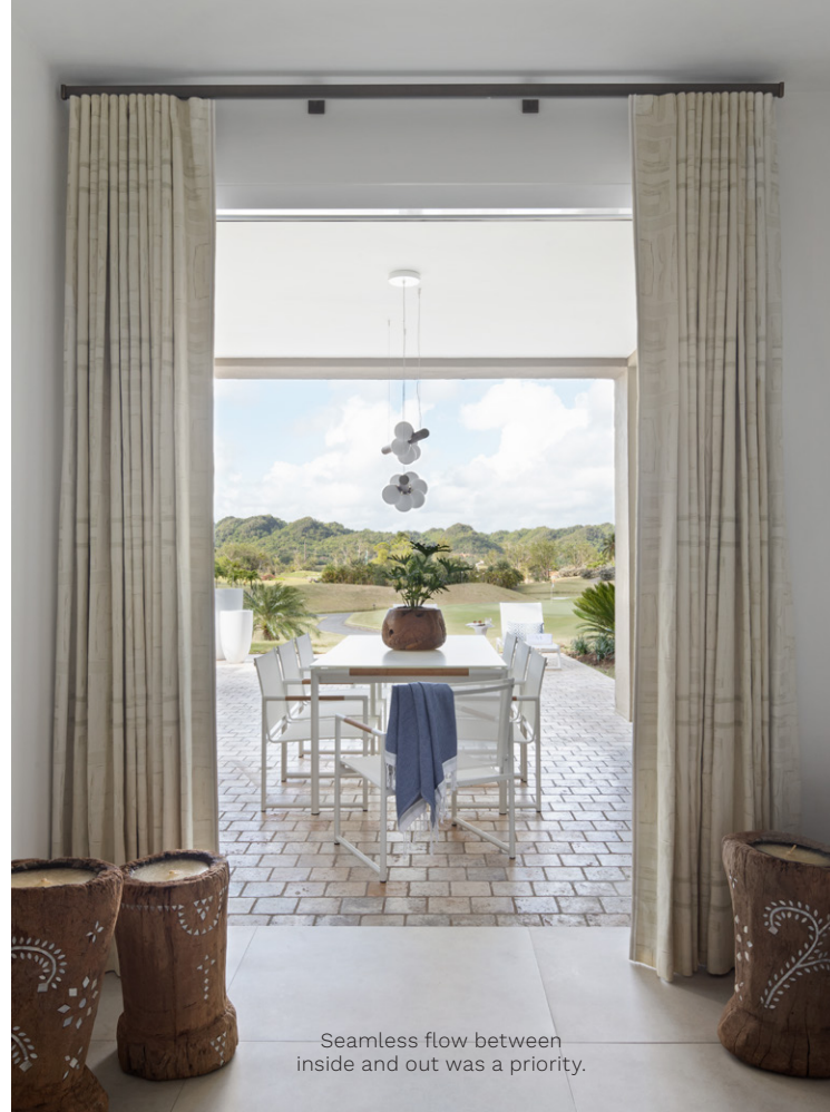
Seamless flow between inside and out was a priority.