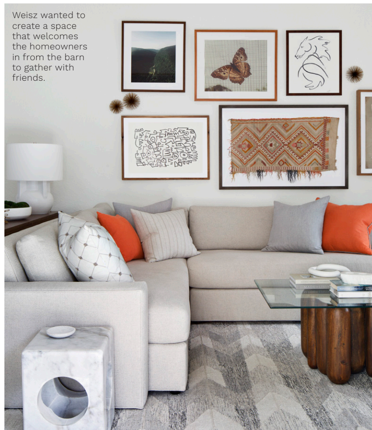
Weisz wanted to create a space that welcomes the homeowners in from the barn to gather with friends.