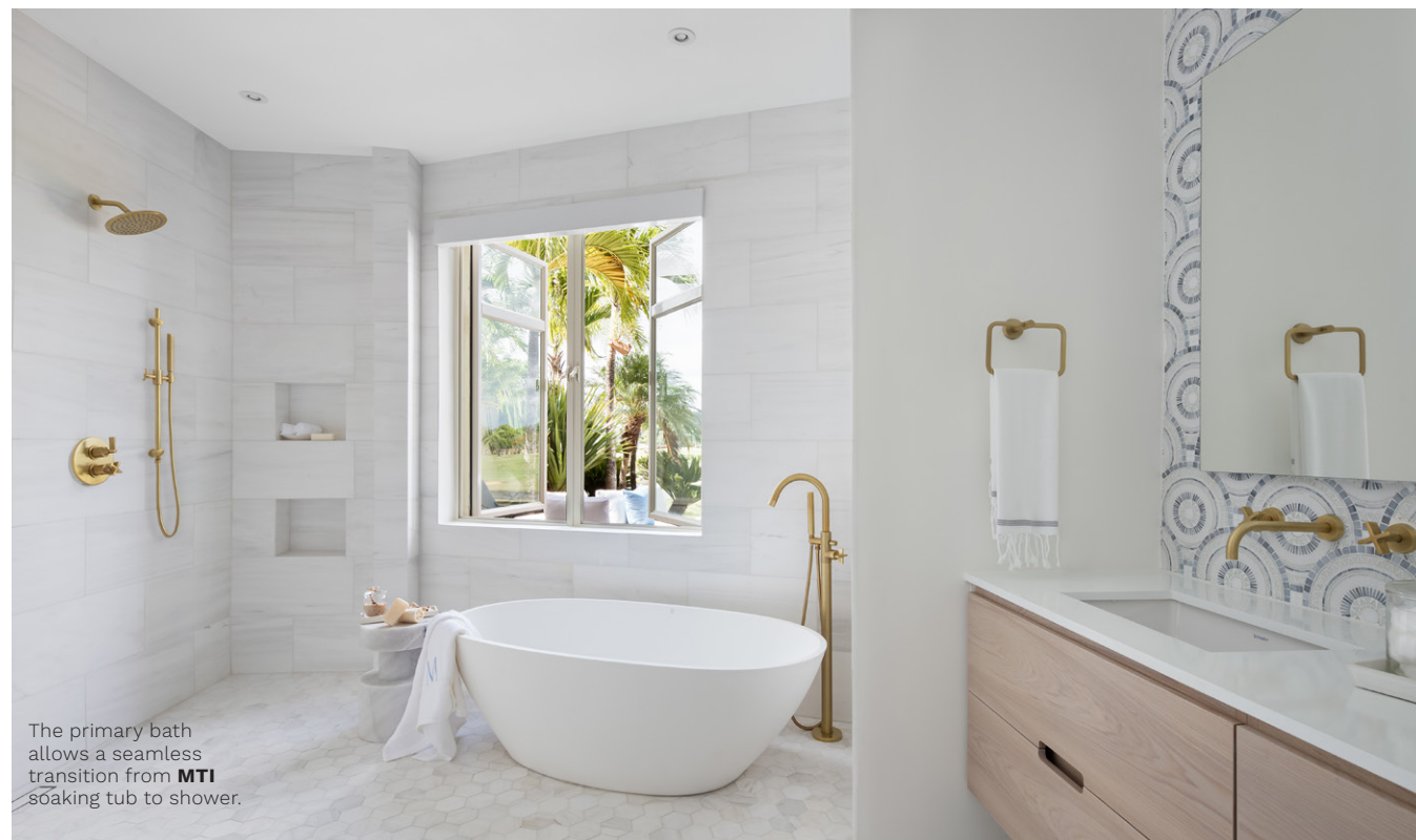
The primary bath allows a seamless transition from MTI soaking tub to shower.