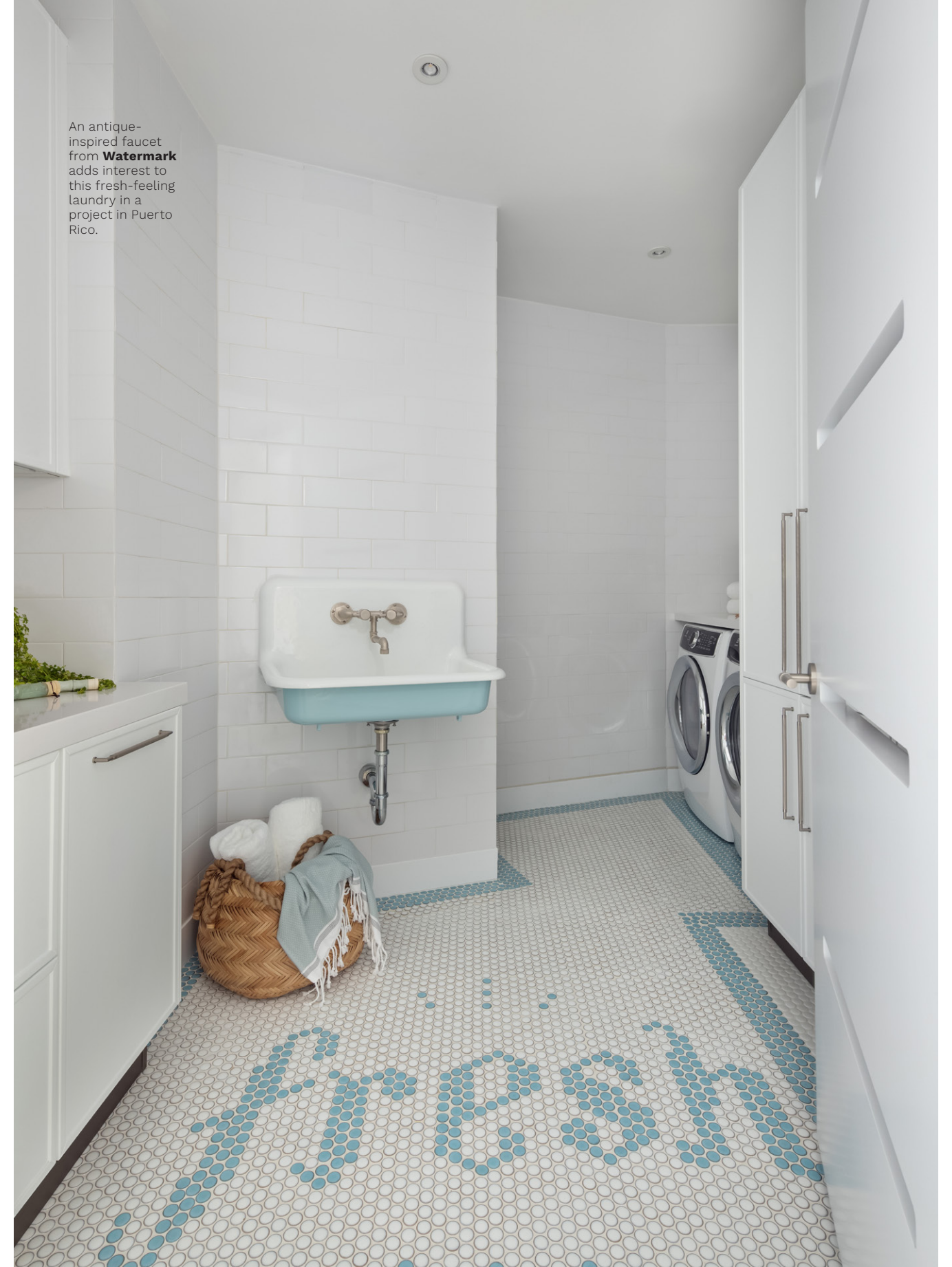
An antique-inspired faucet from Watermark adds interest to this fresh-feeling laundry in a project in Puerto Rico.